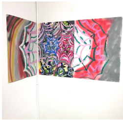
INSIDE (Triptych) 2018 Acrylic and spraypaint on pressed paper 66" x 90" $1100