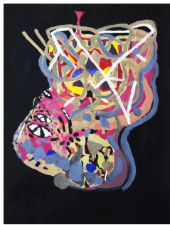
AGENCY 2017 Acrylic on paper 22"x30" $900