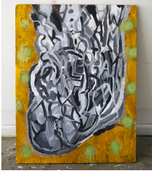
Ska:kam 'O Hegai 2018 Acrylic and spraypaint on wood 24.25"x33" $1100