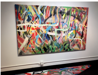
Me, You, We're 2