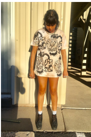
Full of Fire T-Shirts Handpulled litho on cotton Edition of 5 $50 each